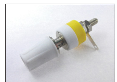
CL1554 - TP/2 WHITE UNASSEMBLED