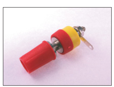
CL1551 - TP/2 RED UNASSEMBLED