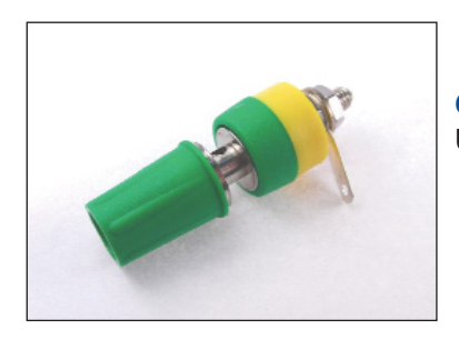
CL1553 - TP/2 GREEN UNASSEMBLED

Unassembled parts come with top and bottom insulators, nuts and washers bulk packed.