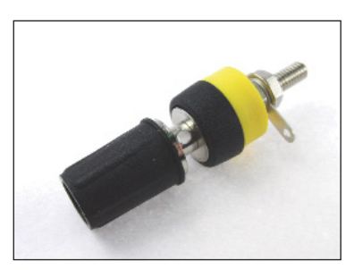
CL1550 - TP/2 BLACK UNASSEMBLED