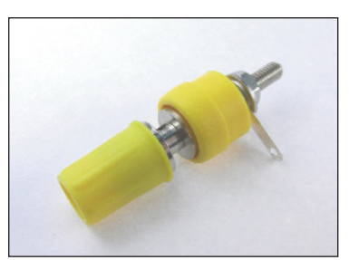
CL1557 - TP/2 YELLOW UNASSEMBLED