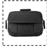
Packa ( optional )