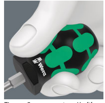
The 2-component Kraftform handle allows high power transmission due to the non-slip, softer grip areas and high working speeds due to the hard grip areas, which allow a quick hand switch.