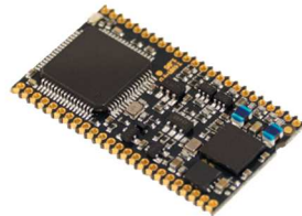
Version C0 (SMT) 31 x 17.8 x 2.7 mm

Elatec's TWN4 family of transponder readers and writers allows users to read and write to almost any 13.56 MHz tags and/or labels – it supports all major transponders from various suppliers like EM, Fujitsu, ST, NXP, TI, HID, LEGIC, etc. and ISO standards like ISO14443A/B (T=CL), ISO15693, ISO18092 / ECMA-340 (NFC).