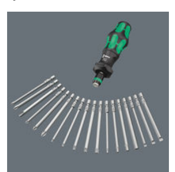
Thanks to the Rapidaptor bit holder, the Kraftform Turbo can be used with all conventional 1/4" bits.