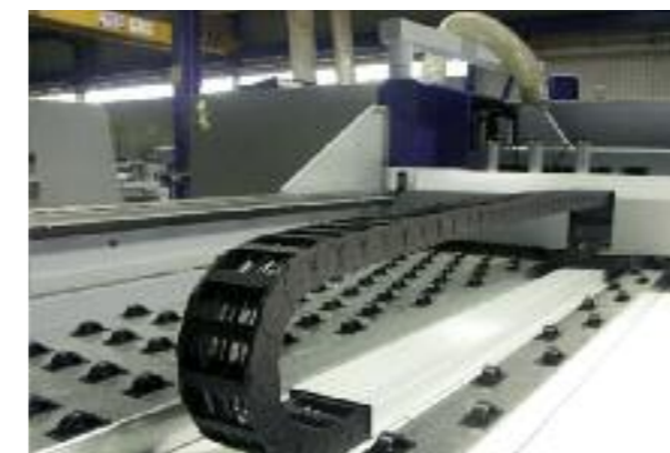
chainflex® CF130.UL for woodworking. e-chain®: E4/light