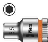
8790 HMA 05003504001 1 x 5.5 x 23 mm 05003505001 1 x 6 x 23 mm 05003506001 1 x 7 x 23 mm 05003507001 1 x 8 x 23 mm 05003509001 1 x 10 x 23 mm 05003512001 1 x 13 x 23 mm 05003499001 1 x 15 x 23 mm