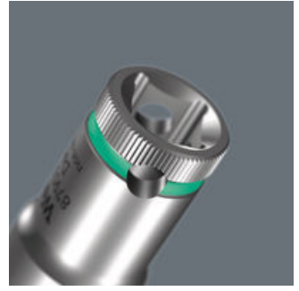
Knurling on lower end for more grip when used manually