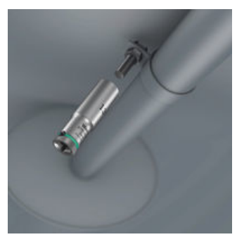
Due to the long design of the socket, screwdriving can also be achieved in small spaces. Fittings with protruding threaded rods are often also possible.