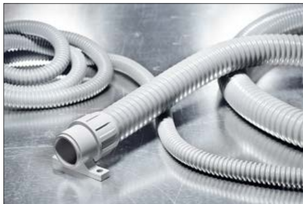
FlexiGuard FG with FG-UH fitting.