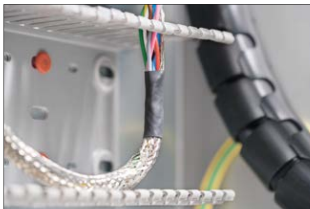
TF21 – available in a wide range of colours and sizes.