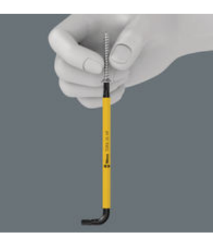
The HF tools developed by Wera are ideal because they feature an optimised geometry of the original TORX® profile. The wedging forces resulting from the surface pressure between the drive tip and the screw profile mean that TORX® screws made according to Acument Intellectual Properties specifications are securely held on the tool!