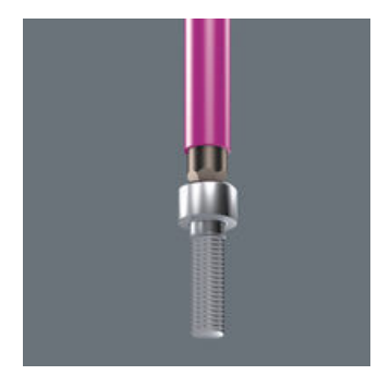
The clamping of the screw is achieved by a flexible locking ball. The holding function is especially helpful in confined, hard-to-reach spaces, where there is no room for a second hand to secure the screw on the tool.

L-keys with retaining function for hexagon socket screws