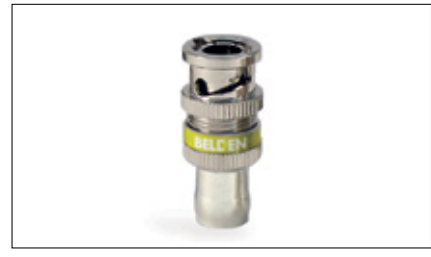
179DTBHDL 179 Digital Truck BNC with Locking Connector