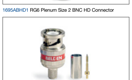
1505ABHD3 RG59 BNC HD Connector