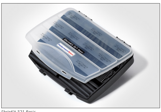
ShrinKit 321 Basic.