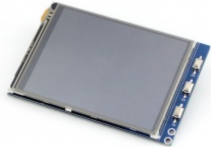
3.2inch RPi LCD (A) 320×240

3.2 inch Resistive Touch Screen TFT LCD Designed for Raspberry Pi, Raspbian IMG Provided