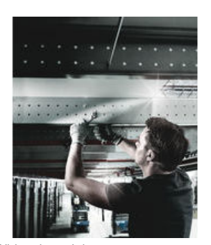
With the Joker, you can now loosen and tighten nuts and bolts, in situations where conventional tools fail. Particularly in confined spaces, where conventional openjawed wrenches cannot be used. The combination of limit stop and small return angle enables eff ective work, even on screw pipe connections.