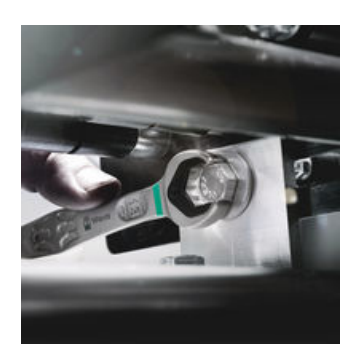
When we began to think about open-ended wrenches, we asked ourselves: why does the wrench always have to be flipped over; why does it have an offset design; why does it slip off injuring fingers? The new design of the mouth resulted in a real "Joker" that works even when all other trumps have been played.