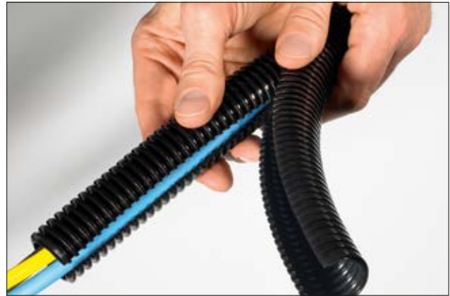
HelaGuard HG-DC double slit conduit is ideal for retrofitting.